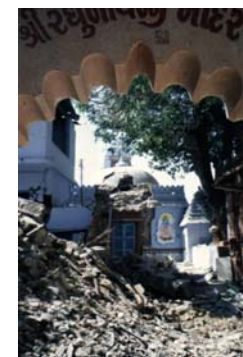
Cultural Heritage damaged by the Earthquake (Gujurat, 2001)

Recent destructive earthquake in Haiti on 12 January 2010 has caused enormous loss of life, property and cultural heritage especially in the historic area of Jacmel. This disaster has once again shown that cultural heritage is highly vulnerable to natural disasters such as earthquake and fire. In the post disaster phase, the challenge is how to salvage heritage properties, which are at risk of demolition and to assess their damage. The long term challenge during recovery phase is how to repair and retrofit them and undertake reconstruction that respects tangible as well as intangible heritage values. This event also brings forward the challenges of engaging various stakeholders at the local, national, regional as well as international levels for protecting cultural heritage during such severe situations.