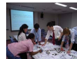
Workshop, ITC 2009