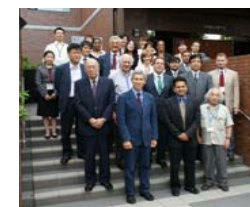
Participants and Resource Persons, ITC 2009

The past training courses have been attended by participants from Nepal, India, Pakistan, Bhutan, Bangladesh, Iran, P.R.China, Korea, Philippines, Indonesia, Taiwan, Serbia and Moldova. Last year's training course was held in Kyoto (Japan) and Kathmandu (Nepal). In the Kathmandu part, ten participants from Nepal participated as observers.